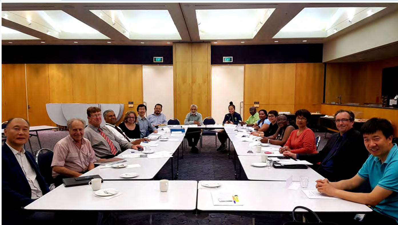
Photo of the steering committee