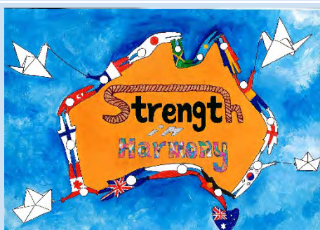
Newington Public School (Primary)