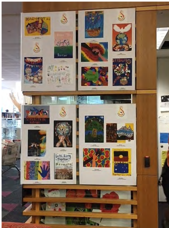
Display of a selection of winning posters from the 2017 competitions at the Blacktown library

"Thank you to you and your organisation for a lovely ceremony yesterday and for making us feel so welcome. It really was an eye opener for our students and it is certainly a day they will never forget"