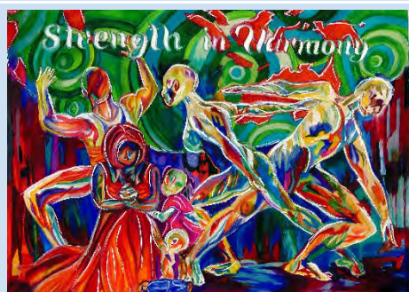
Nepean CAPA High School (Secondary)