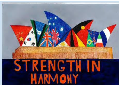
Korean Catholic Language School (Secondary)