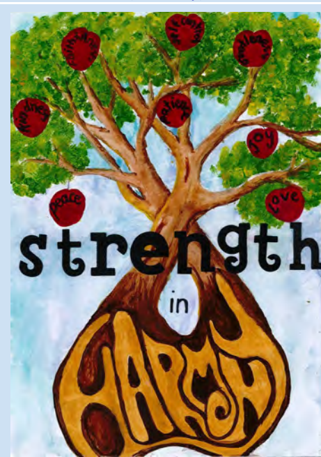
Berowra Christian Primary School (Primary)