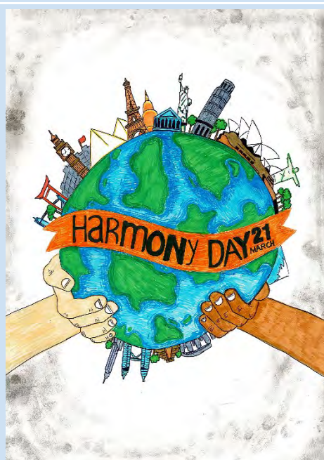
Ben Venue Public School (Primary)