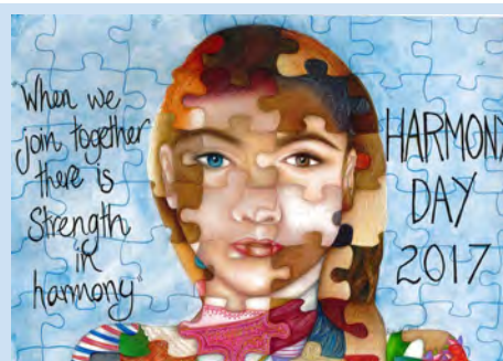
Nepean CAPA High School (Secondary)