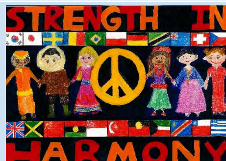
Korean Catholic Language School (Primary)